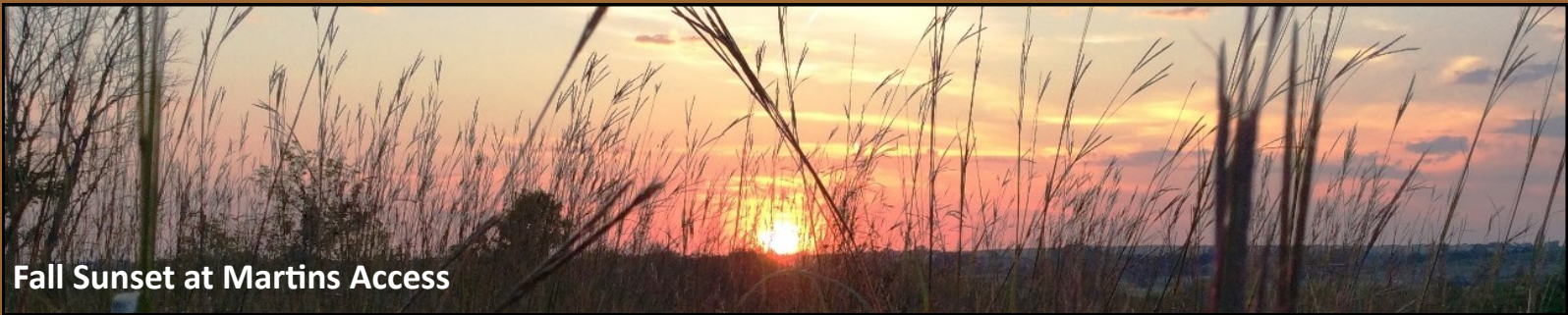
Fall Sunset at Martins Access