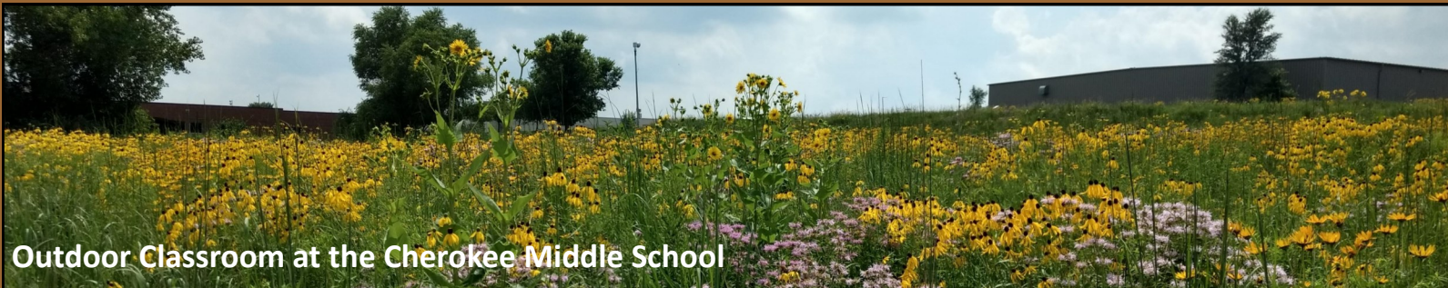
Outdoor Classroom at the Cherokee Middle School