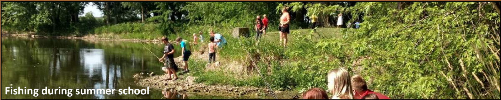
Fishing during summer school