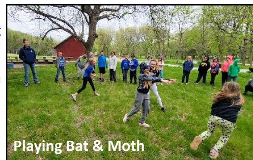
Playing Bat & Moth

The cover photo for this newsletter is of the 3rd grade from MMC-RU and their field trip to Silver Sioux Recreation Area. I want to highlight this field trip because it's more than just a hike on the trails to the observation deck. During the school year we talked about bats, then came out to the park where we looked at studies done by ISU and the IDNR, used scientific reasoning to talk about what their study results tell us about the bat population in the area, then take a hike to look further observe the habitat around us where the study was actually conducted. Connecting conversations from the classroom to the outdoors really helps to create understanding and a sense of place.