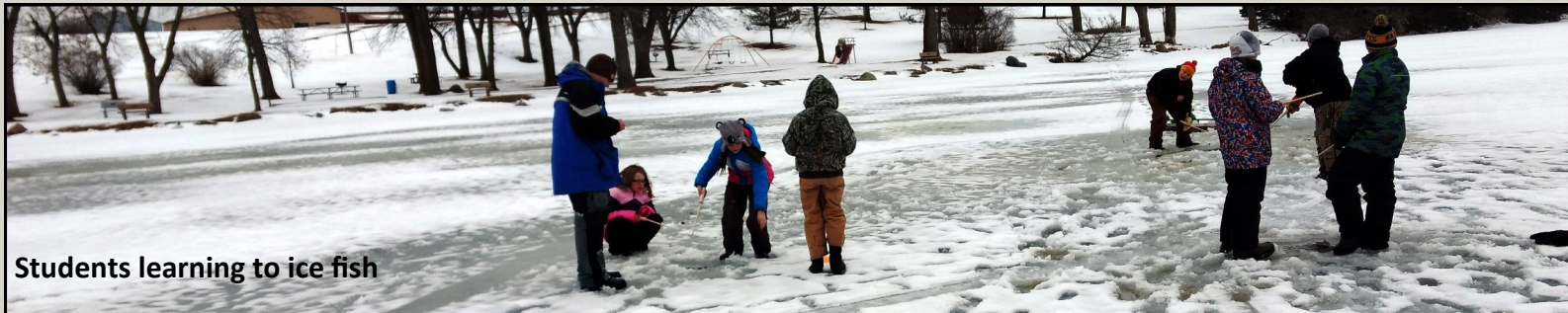
Students learning to ice fish