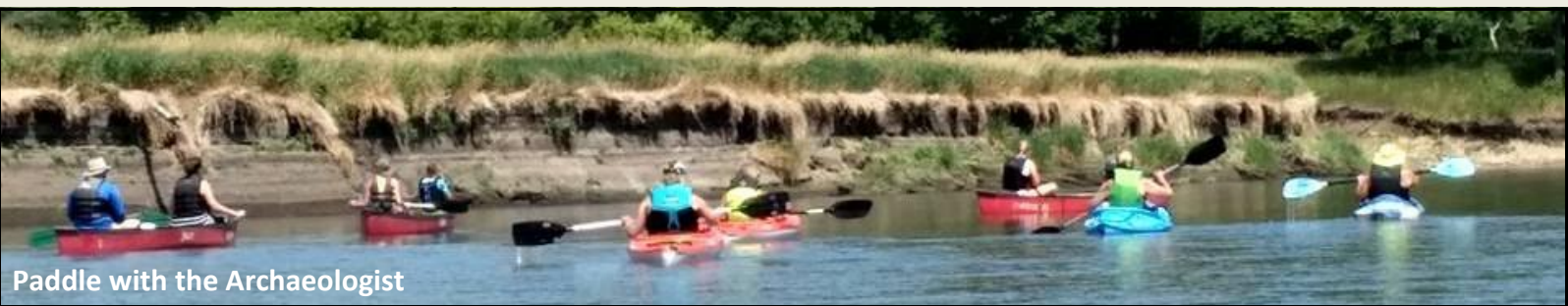
Paddle with the Archaeologist