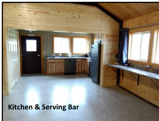
Kitchen & Serving Bar