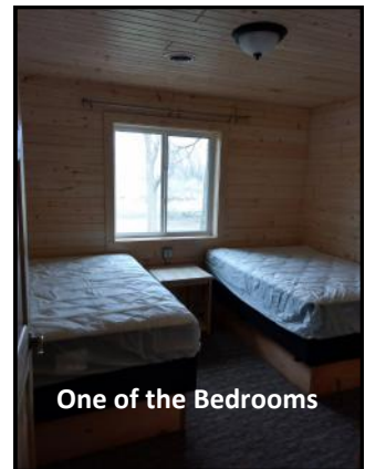
One of the Bedrooms