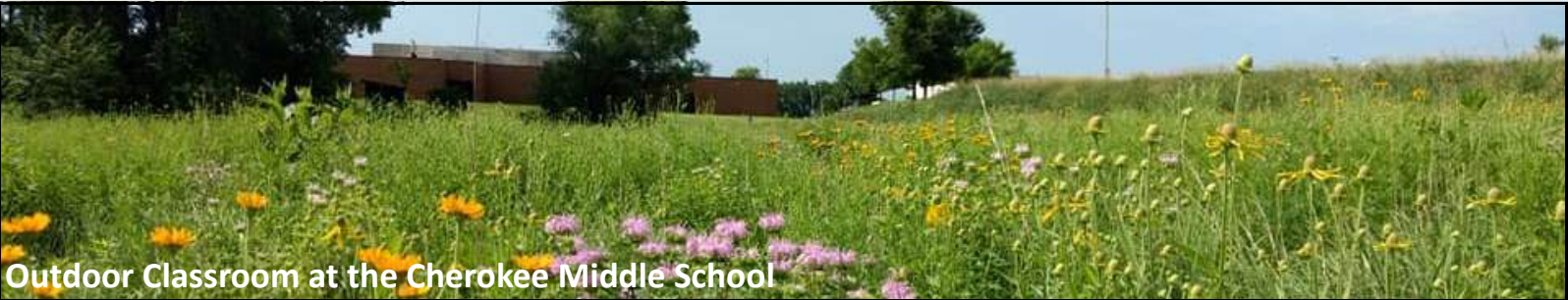
Outdoor Classroom at the Cherokee Middle School