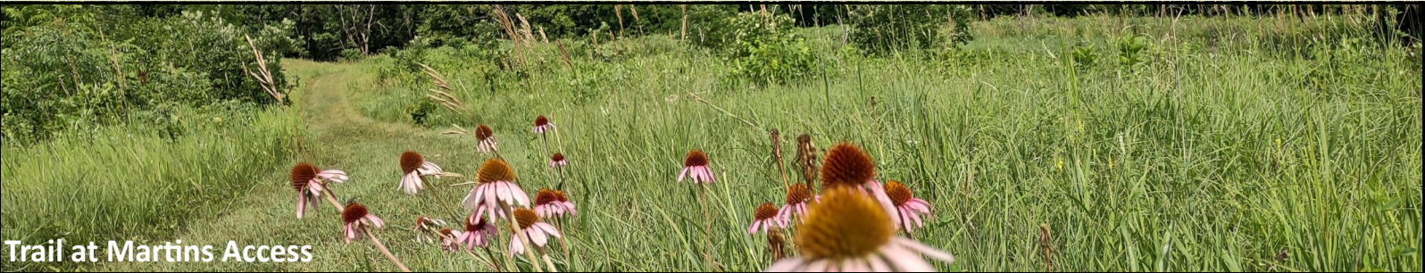
Trail at Martins Access