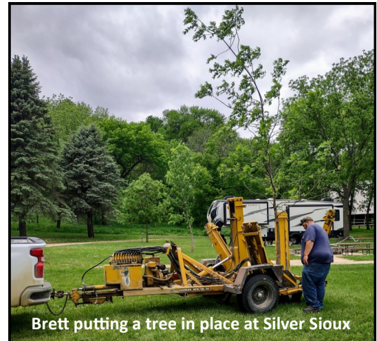
Brett putting a tree in place at Silver Sioux

— Replaced additional rotten park signs.