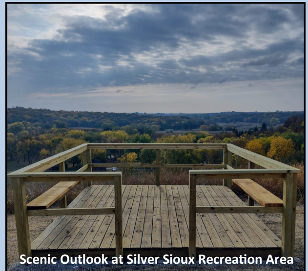
Scenic Outlook at Silver Sioux Recreation Area