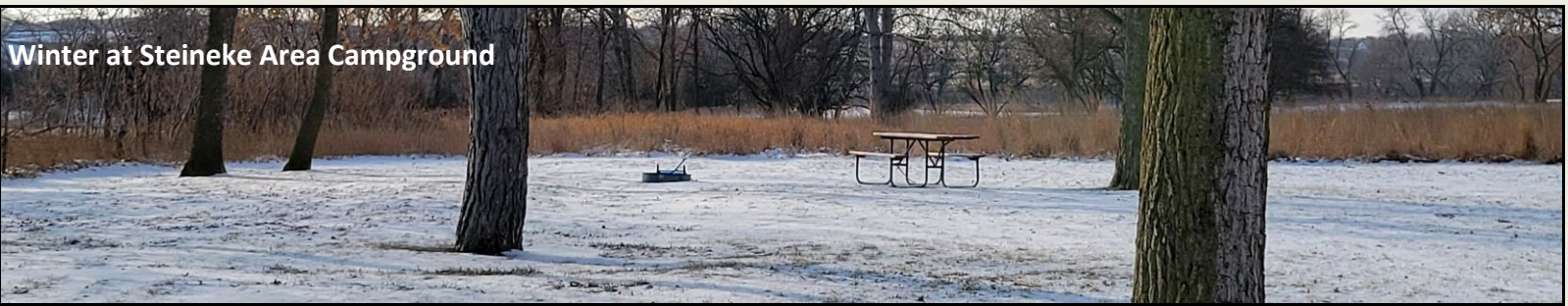
Winter at Steineke Area Campground